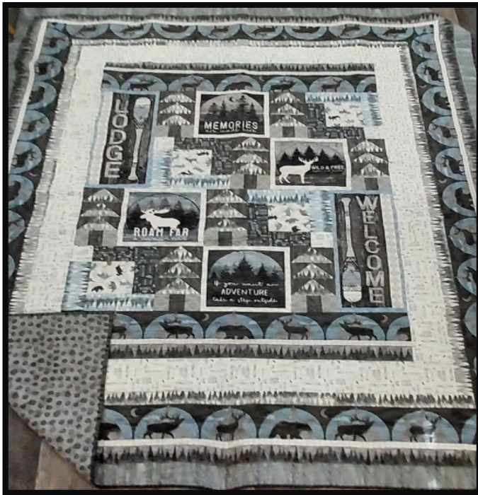
Queen Size Quilt

Quilt drawing August 12, 10am at fairgrounds