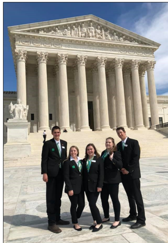
2018-19 Idaho 4-H State Teen Association Officers representing Idaho at National 4-H Conference in Washington, D.C.