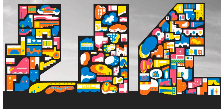
Cartoonish Metropolis, Bureau Spectacular, 2012

The world interior of capital is not an agora or a trade fair beneath the open sky, but rather a hothouse that has drawn inwards everything that was once on the outside.